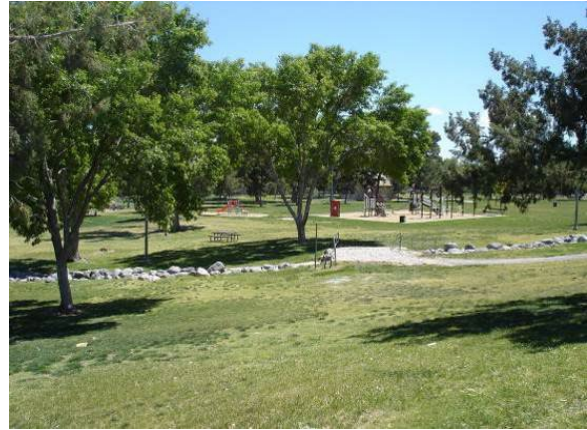
The city will continue to expand its system of parks and trails (linear parks).

between residential areas and school facilities.