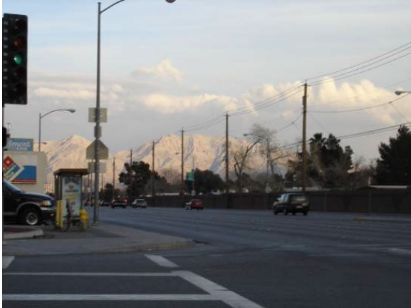
Gateway improvements within the Downtown could vastly improve entry points to the city.

Develop gateways to denote entry into the Downtown and provide a system of well-coordinated signage to assist residents and visitors in finding their way to its various destinations.