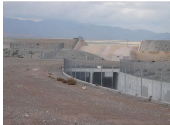
Safeguarding the water supply is a key concern for all communities within the Las Vegas Valley.

Pursue the development of a wastewater treatment facility with sufficient capacity to serve the needs of the community into the future.