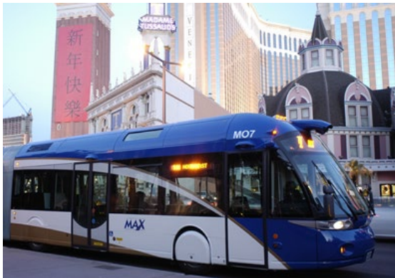
The MAX bus that serves North Las Vegas is a highly used example of Bus Rapid Transit.

Create an integrated multi-modal transportation system providing residents a variety of options for their daily travel, including mass transit, car, bicycle, and walking. All modes of travel will be well-integrated with each other and with the development they serve so residents and visitors can easily travel between different destinations and areas of the city.