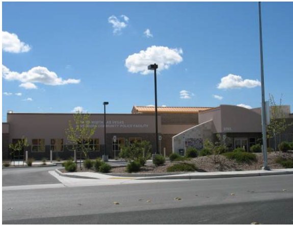
Schools are a key component of the quality of life in a city and should be well-planned.

North Las Vegas will achieve this vision by attaining the following goals: