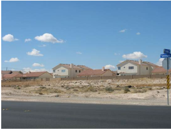
Vacant parcels within developed areas of the city offer opportunities for infill development.

zones to support and promote a bustling university and business environment.