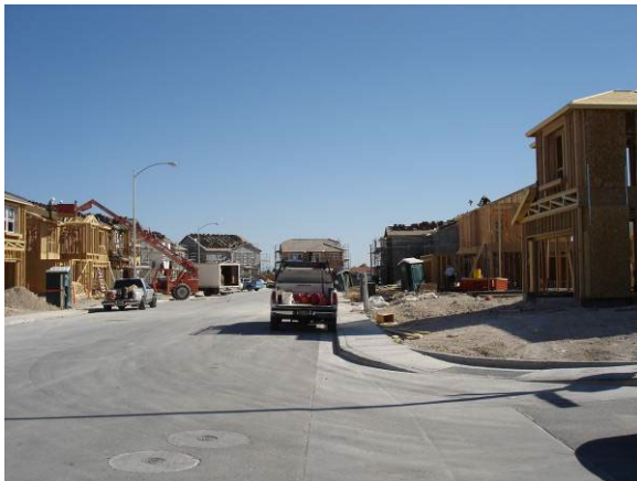
The fast pace of development necessitates a well-organized, efficient approach to planning and implementing additional infrastructure and services.

Encourage new development to pay for the services it requires. Create an evaluation tool to assess and evaluate public costs associated with new development and implement cost-sharing mechanisms and programs by working with the development community.