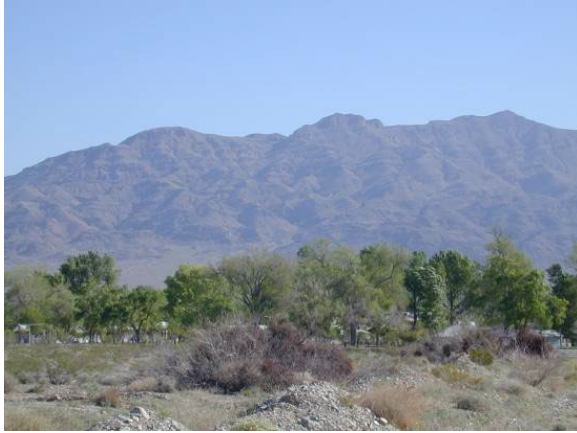
Conservation of key resource and archeological areas will remain a priority within the city.