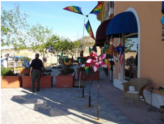
This neighborhood center offers a welcoming pedestrian area for neighborhood residents.

The city will design and develop as a collection of distinct and attractive “Villages and Neighborhoods,” multi-use areas each possessing a unique sense of place and shared identity.