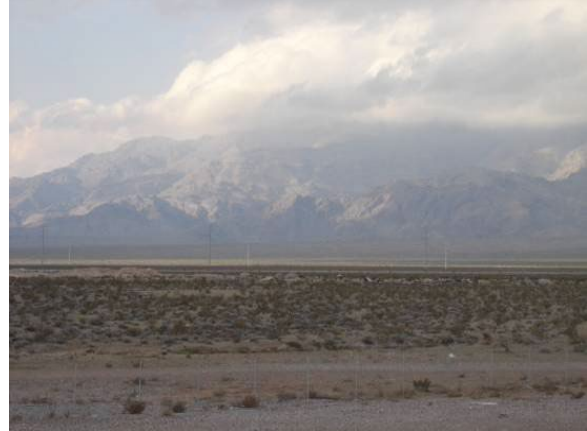
The Northern Development Area, currently undeveloped lands held by the Bureau of Land Management (BLM), is a prime opportunity area for the city.

transportation and services to meet the needs of businesses, and consider other means of integrating supporting uses in these areas into cohesive activity centers.