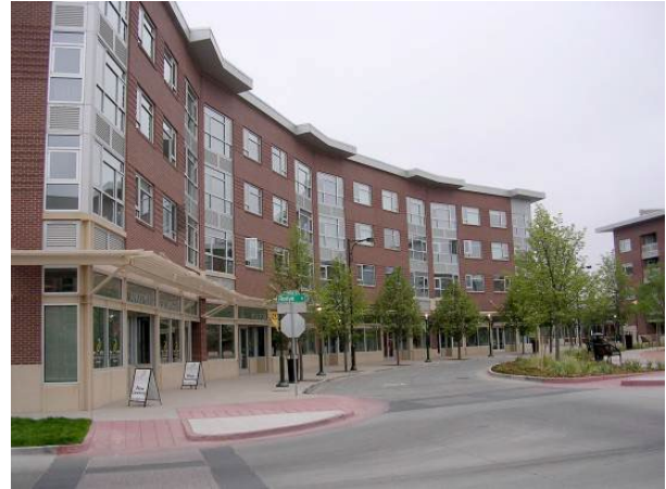
Higher densities are encouraged near transit stations to encourage use of transit.

Identify, in collaboration with the Regional Transportation Commission (RTC), future mass transit corridors throughout the city to create a cohesive system to meet the transportation needs of the current and future population. These corridors should be well connected and served by supportive transit such as feeder bus lines, as well as streets and pedestrian connections.