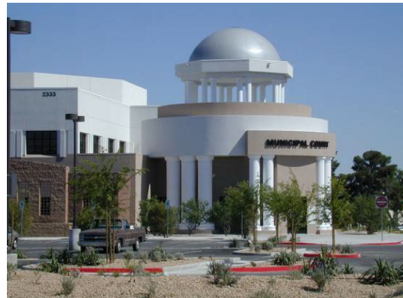
City facilities' design should create attractive and distinctive, connected places.

Create great civic spaces by locating and designing major public buildings and infrastructure in a manner that enhances and integrates into their surroundings. Create a City Campus with a strong civic identity, with gathering places and pedestrian connections.