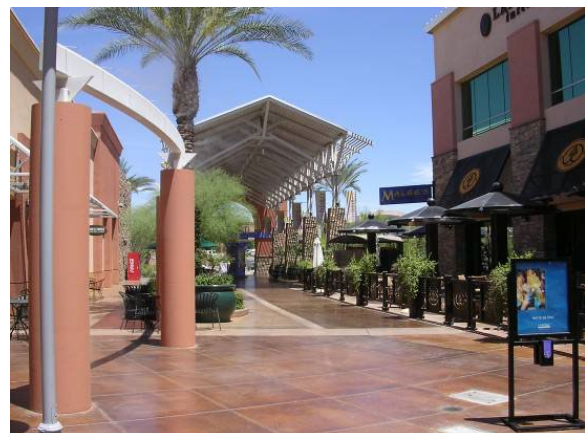
Mixed-Use commercial centers provide concentrated areas of goods, services, and social interaction.

centers in appropriate areas designated as Mixed-Use Commercial on the Land Use Plan map (Figure 4-1). This includes locations within the Downtown to be delineated through the Downtown Master Plan process and areas in the vicinity of the northern beltway and the city’s planned transit corridors or other high-volume transportation corridors, to create a distinctive shopping attraction for residents and visitors. (See Figure A-7: Major Transportation Corridors in Appendix A.) Regional centers should be larger in scale than a community or neighborhood commercial center and should offer stores not typically duplicated within a community, such as high-end or specialty retailers. While these may have all of the offerings of a typical mall format, the center should focus on quality design and site planning to allow for multi-modal access with particular emphasis on connections to the North 5 th transit corridor. Site design should incorporate various pedestrian amenities and relate well to the adjacent UNLV and VA Hospital activity centers of the Northern Development Area. (See Figure 6-1: Planning Framework.)