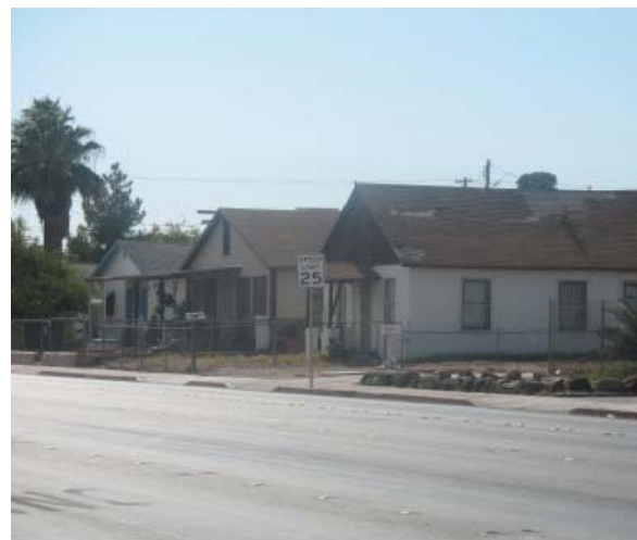
Existing neighborhood in the mature area of the city.

Code Enforcement provides a direct, contributory role in enhancing public safety, reducing neighborhood decline and stabilizing communities in the more mature areas of the City.