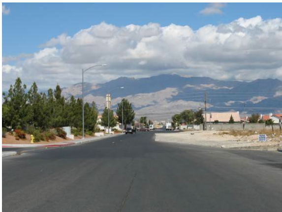
Sawtooth roads with unfinished segments, a common site in the city today, create traffic and safety issues.

Identify funding mechanisms and work with developers to better plan and complete roadway improvements at the time of development to avoid the problem of “sawtooth” roads and to offer a safe and uninterrupted citywide roadway network.