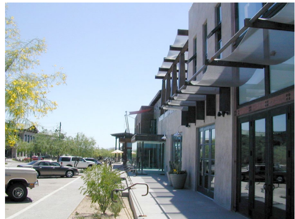
New Master Planned Communities will provide a range of housing, connective parks and open space, and pedestrian-oriented mixed-use town centers.

Establish a set of evaluation criteria to promote high-quality development and achieve land use and quality of life goals for the city.