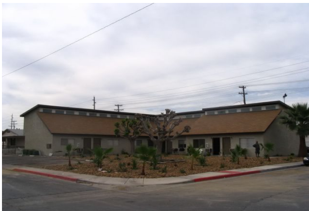
Accessory dwelling units appear under many aliases – granny flats, garage apartments, carriage houses, ancillary units – and they provide an extra tier of housing options,

Promote and provide incentives for well-designed mixed use residential / non-residential developments in areas that allow mixed uses, where residential use is appropriate to the setting, and development impacts can be mitigated. Allow residential use as part of mixed use projects, particularly in the downtown area.